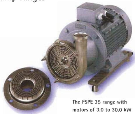
The FSPE 35 range with motors of 3.0 to 30.0 kW and rotor diameters of 145 to 250 mm are particularly suitable for high viscosities and throughput rates.