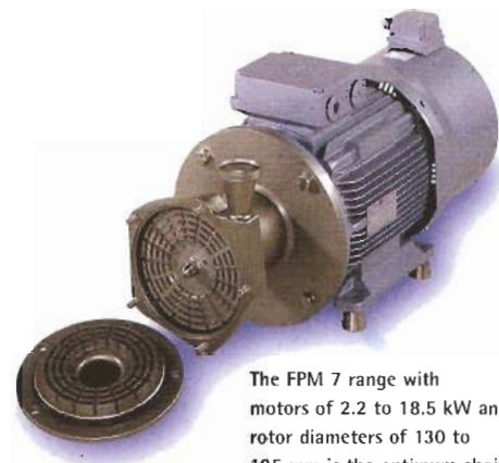
The FPM 7 range with motors of 2.2 to 18.5 kW and rotor diameters of 130 to 195 mm is the optimum choice for handling medium viscosities and throughput rates.